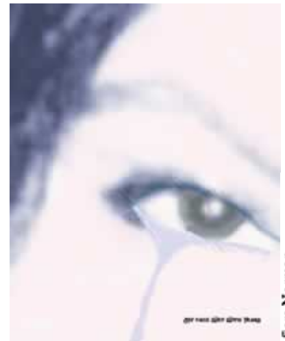
My Face Wet With Tears

the generosity of these women is humbling food and plants the offerings that taste of otherness but level difference as their fragrance wafts hope, friendship, love