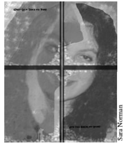
When Cold does its part And You Break my heart