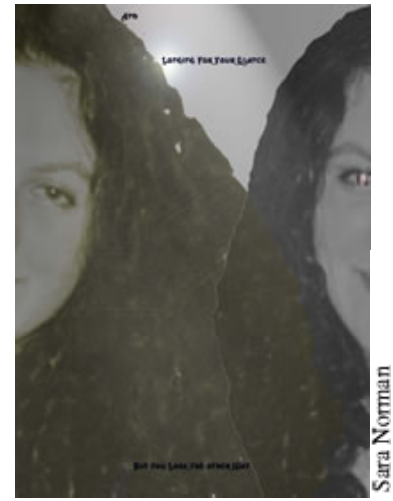
And longing for your glance, But you look the other way

iamwritingthisonthebackofachequetheonlypapericouldfind inthecarwaitingoutsidetheschoolfordaughters thishastobeasmallpoem noroomforthefightwithmysister she'sdoingtoomuchforourmotherandresentsme thishastobetinyroomforresiduemourning adeadfathermychildhoodhomesoldcalgarysummersmemories likecancelledchequesthishastobeshorthand needtosaybasis likeBLBST'SPTRYwithoutVWLS headlinersMDLFSKSbut hey'i'malive huntingforpiecesofpapersshortpoems waitingifillchequeswithwords waitingforthepaintosubside waitingfordaughters nopaperonlyallthis