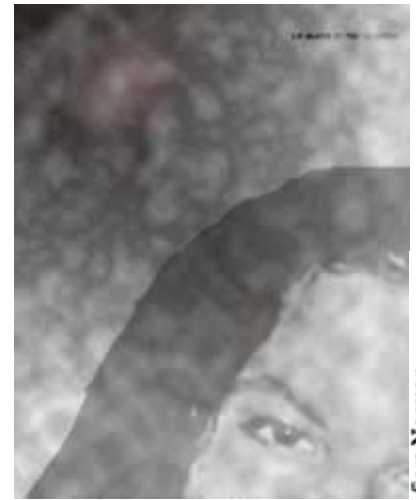
I'm alone in the silence

Perhaps it is in the doing that we find (our)selves when we feel lost, in the doing that we lose (our)selves so something can be